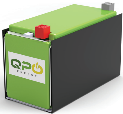
Residential, Land/Water vehicles, ATV, etc.